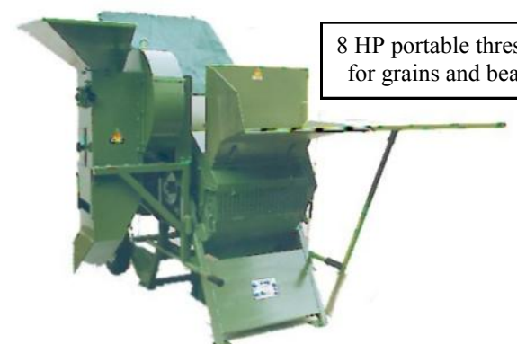
8 HP portable thresher for grains and beans