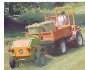
One of several small round balers that can be operated behind small 20 HP transporters or tractors.