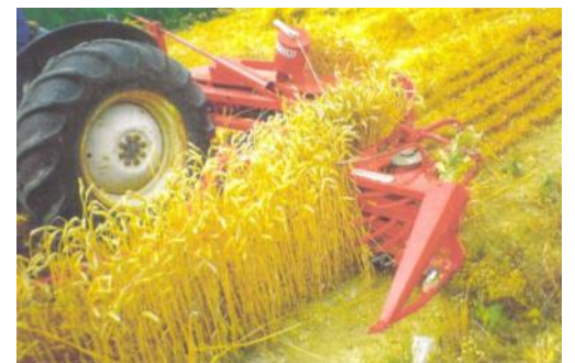
3 PT mounted reaper binder takes just 20 HP, cuts 56" swath and ties grain into bundles to complete drying.