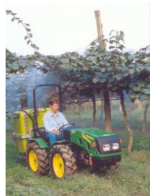
26 HP Ferrari Vipar crop protection shown applying bordeaux mix on grapes.