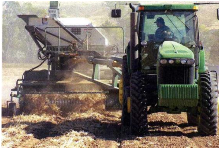
When bean vegetation is sufficiently dry the large scale grower would use a special pull type combine to pick up windrowed plants and thresh out beans as it travels along windrow. There is no economically viable small version of this machine.

For the smallest scale grower a walking tractor with sicklebar mower can do the job. Note there are dedicated motor mowers and sicklebar mower attachments for walking tractors.