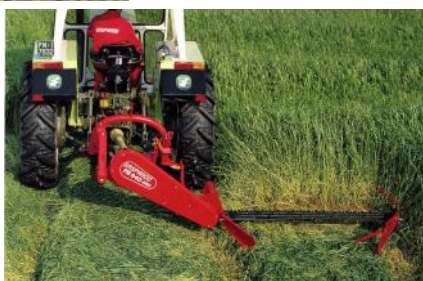
For conventional tractors rear mounted drum mower or double acting sicklebar mower will do