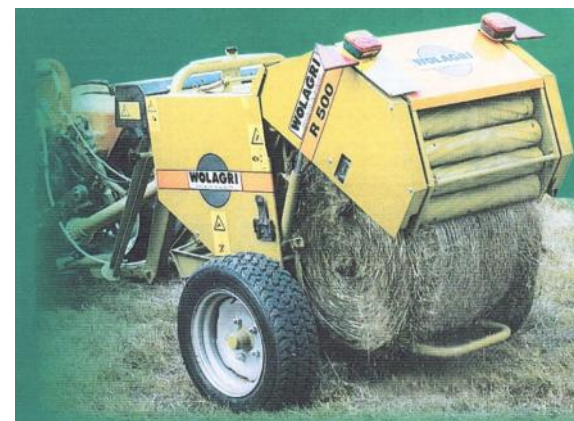
The smaller scale producer can instead use a small round baler with a net wrap option to pick bean material from windrow to form small round bales that are easy to handle and store. The net wrap helps to retain beans until you have time to put them through a stationary thresher. These balers come in sizes powered by 15 plus HP tractors.