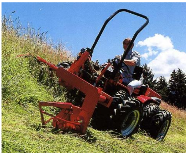
Those working on a little larger scale could use a bidirectional tractor with front sicklebar mower or drum mower that cuts and windrows all at once. Pictures show mowers cutting grain and hay but can do many other crops that need to be cut before they are completely dry or ripe.