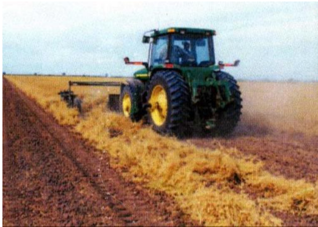
When beans are mature plants they are cut off at ground level and left in a windrow to allow vegetation to dry. In large scale operations special front mount sickle bars cut and windrow several rows at a time.