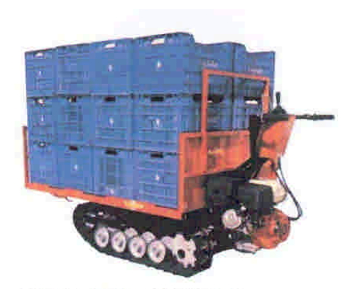
GRAPE AND ORANGE LUG CARRIER

Those planning high density cropping systems and those who farm slopes or terraces should look closely at the Rotair system before trying to solve mechanization problems with conventional tractor implements. The basic tracked power unit costs $15,000.