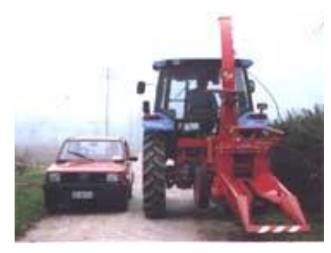
Model 343 in transport mode.

Another manufacturer offers a corn chopper that blows chopped corn into a separate wagon. This simpler version is 3 pt. mounted and in cutting mode operates to the right of tractor. When in transport mode it can pivot 180 degrees so that is directly behind the tractor allowing it to pass through any gate the tractor can. The model 343 costs $14,000 Fob Portland, Oregon.