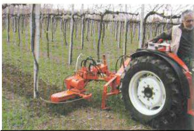
Rinieri EL 140 tilling berm area. Note sensor has finer sensitive touch.

The most recent addition to inrow tillage options is the power harrow designed to take out weeds and leave soil flat with little lateral soil movement. Rinieri is the dominant supplier in the type of tillage with front mount and rear mount in dozens of sizes and configurations including models that can do two rows simultaneously.