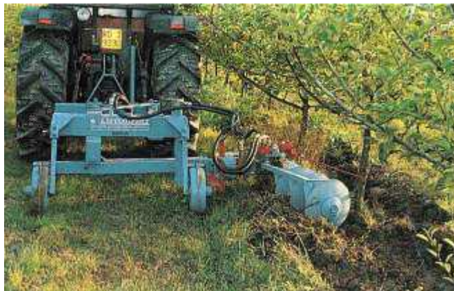
A. Spedo TPE powered berm disc showing aggressive weed control