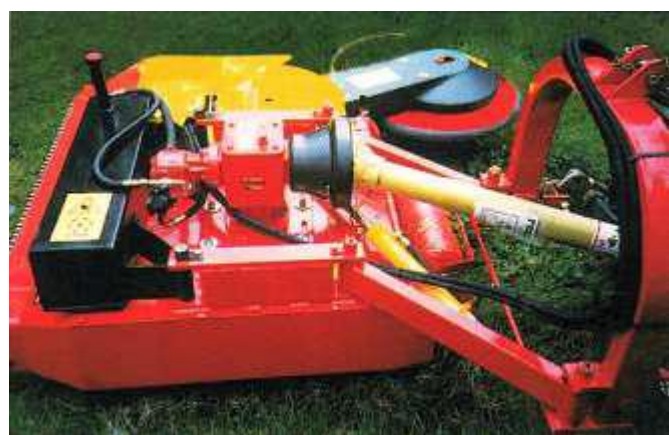
Fischer SL90—Front mount rotary mower with sensor controlled rotary outrigger.

and around trees and vines there are many options including berm discs, hoes, tillers and power harrows. As with the mowers the ideal mount is in front of the driver of a bidirectional tractor to facilitate accurate steering and close monitoring of tillage operation, again as with the mowers, rear mounted versions of the same tools are available in many sizes. A few versions can be mid mounted placed just in front of rear wheel of tractor so that operator can look down to monitor operation.