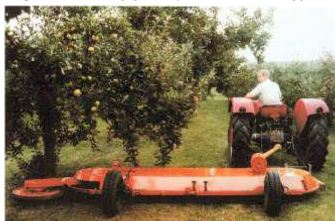
Another Perfect designed to reach under large low overhanging canopy.

roll around base of tree or vine. They are mounted on a spring loaded arm that causes outrigger to move back into interrow space after the guard passes tree or vine.