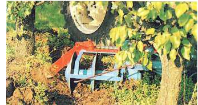
Close up of A.Spedo mounted side of tractor working in close planted trees.

The most recent addition to inrow tillage options is the power harrow designed to take out weeds and leave soil flat with little lateral soil movement. Rinieri is the dominant supplier in the type of tillage with front mount and rear mount in dozens of sizes and configurations including models that can do two rows simultaneously.