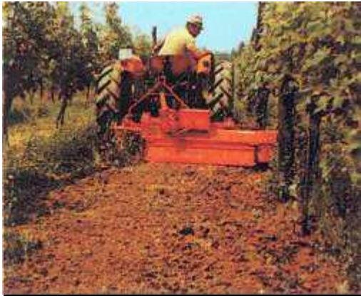
Gramegna articulating rototiller

Next on the scene is the berm disc tillage led by A.Spedo. These tools consist of a small gang of 17” diameter disc with hydraulic sensor that moves in and out of the berm area to tear up grass. Now that these disc gangs are hydraulically powered not just ground driven, they are very aggressive to take out even the most well rooted plants.