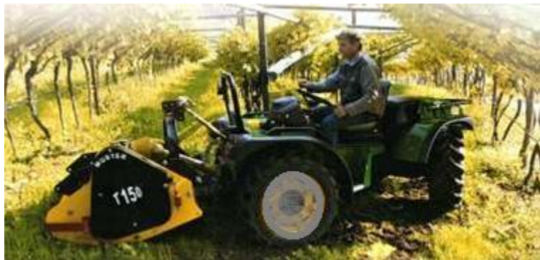
Ferrari Dual Steer Vega 75 (64 HP) shown with BCS Muster double rotor flail mower, weight of tractor and mower equally divided over four equal size drive wheels.

Efficient effective beneficial control of vegetation begins with the choice of the tractor. The ideal tractor needs even weight distribution to minimize compaction. Weight and traction proportionate to actual traction required minimizes compaction and improves fuel efficiency. A low profile allows close work and maximum maneuverability and maximum visibility giving maximum driver improved control and efficiency.