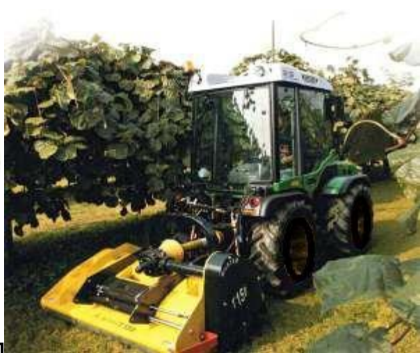
Muster mowers have 2 flail rotors to reduce vegetation to fine mulch and can offset to work under overhanging plants and around obstacles. The Muster can be used in front or behind tractor.