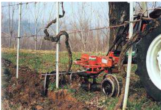
Rinieri powered berm disc cutting deep.