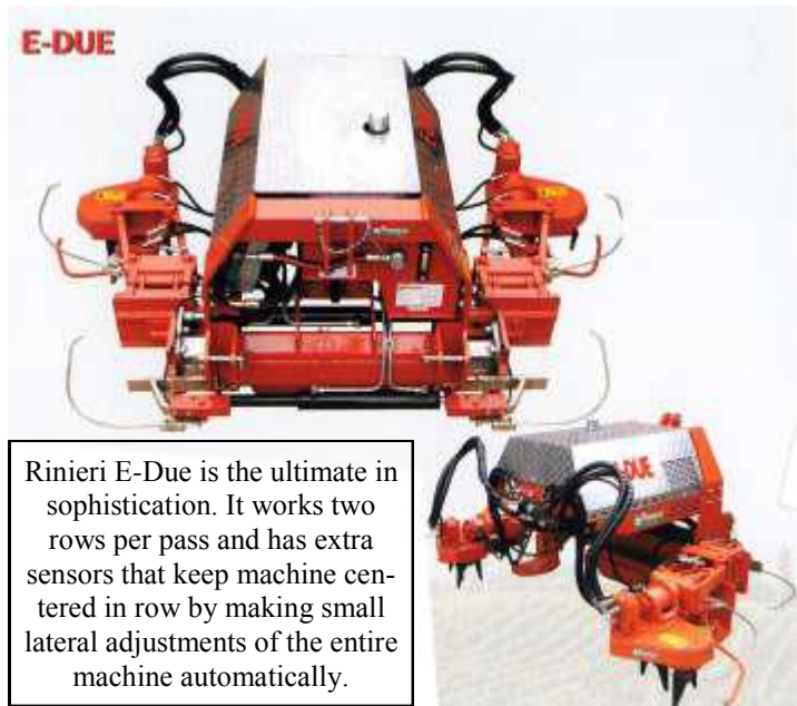
Rinieri E-Due is the ultimate in sophistication. It works two rows per pass and has extra sensors that keep machine centered in row by making small lateral adjustments of the entire machine automatically.

Still another berm tillage tool is the Pellenc “Sunflower” that uses a rotary plow that digs just (2) inches deep to uproot weeds. It does not use a sensor system, instead a rotating star shaped plastic guard system contacts trunk and moves spring loaded arm back until cutting head passes plant. Unique shape of guard allows it to work within an inch of vine trunk. Two choices of cutters allows it to work at surface to take down tall weeds or to cut (2) inches deep much like the power harrow.