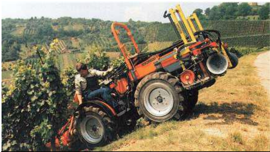
Clemens hoe mounted on front of Goldoni tractor leaves 3 pt. free to run mower simultaneously.

The first of these articulating tillage tools to be adopted is the “vineyard hoe” a horizontal blade that cuts an inch or two below the soil surface to kill weeds. Brands like Clemens and Braun led the way. These units work best on lighter soils and where raised berms require them to merely clip tops of raised berms.