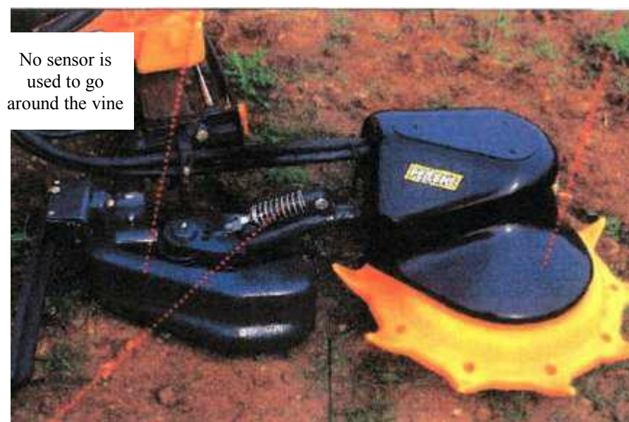
No sensor is used to go around the vine

Still another berm tillage tool is the Pellenc “Sunflower” that uses a rotary plow that digs just (2) inches deep to uproot weeds. It does not use a sensor system, instead a rotating star shaped plastic guard system contacts trunk and moves spring loaded arm back until cutting head passes plant. Unique shape of guard allows it to work within an inch of vine trunk. Two choices of cutters allows it to work at surface to take down tall weeds or to cut (2) inches deep much like the power harrow.