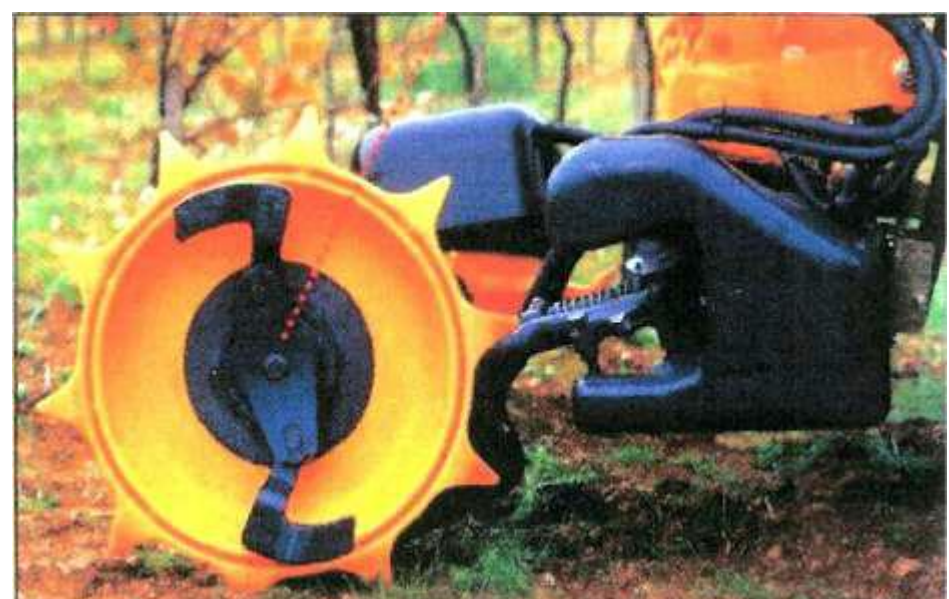
Pellenc Sunflower shows single rotor with plows