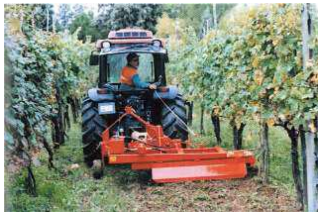
Rinieri EP works like the EL but works deeper and wider.