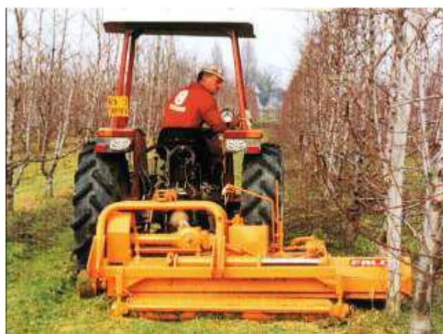
Falc Sonar Shredder is a heavy duty flail mower that offsets 16 inches automatically when sensor wand touches tree. All hydraulics are self contained and unit can be used either front or rear mounted. Shown on Antonio Carraro Bidirectional tractor.

Mounting a more sophisticated flail or rotary mower with a hydraulic sensor, the mower can reach in and mow berm area between trees or vines in the row. These units withdraw from interrow when the sensor wand touches tree or vine. The sensor's touch is so light that bark is not damaged.