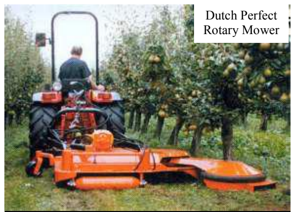
Dutch Perfect Rotary Mower