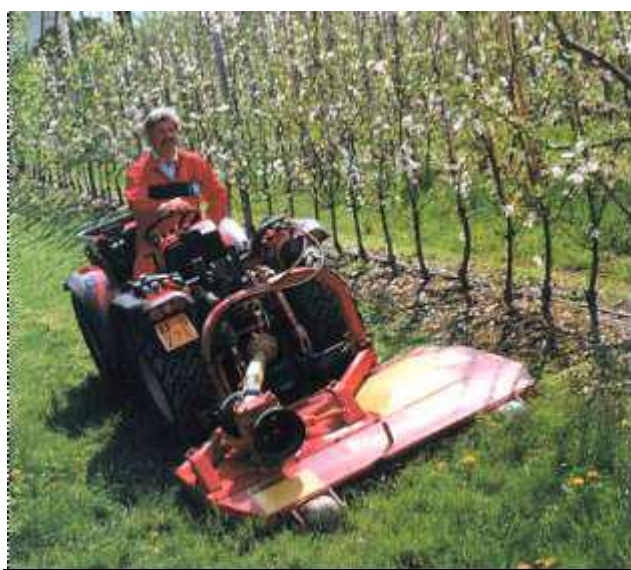
Antonio Carraro SRX 8400 articulated 63 HP bidirectional tractor shown with a rotary mower with manually controlled parallelogram hydraulic offset.

Three makes of tractors offer all these features in their Isometric bidirectional models. Ferrari offers all these features in models from 35 HP to 90 HP Antonio Carraro offers all these features in models from 63 HP to 90 HP. Goldoni offers one model at 65 HP.