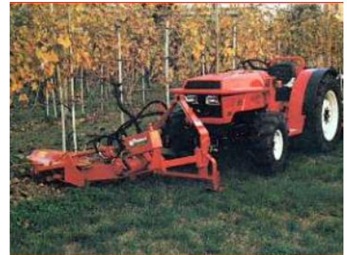
Rinieri FS-A Front mount rototiller