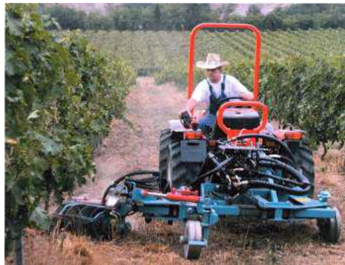
Bidirectional Goldoni Maxter W70 REV with A.Spedo berm disc

There are a number of mowers designed to mow centers, under tree skirts, as well as the interrow spaces between trees and vines. These can be flails or rotary mowers equipped with outrigger with rotary mower heads. In their simplest form they have a rubber bumper on a rotating guard system so that outrigger can