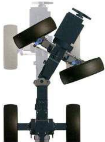
Dual Steer is unique steering system that combines conventional front axle steering with an articulated chassis to give 70 degree turns.