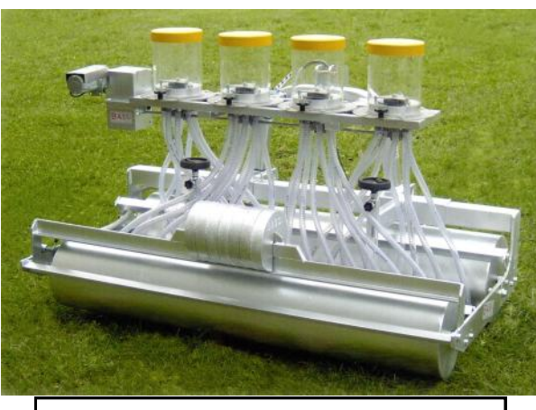
Bassi Seed Spider plants high density greens.

The Trattorini's versatility extends to field crops such as hay and grain as well as permacultures such as vineyards, orchards, and woodlots. Appropriately sized implements aid proper establishment and harvesting of these diverse crops.