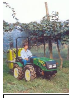
26 HP Ferrari Vipar crop protection shown applying bordeaux mix on grapes.