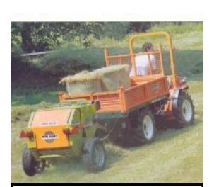
One of several small round balers that can be operated behind small 20 HP transporters or tractors.