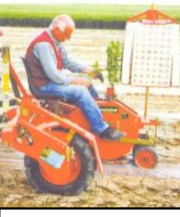
Transplant seedlings or soil blocks or bulbs with 20 HP.