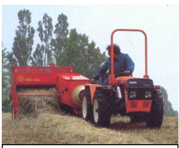
25 HP Trattorini powering a small square baler to produce 60+ pound bales of hay.