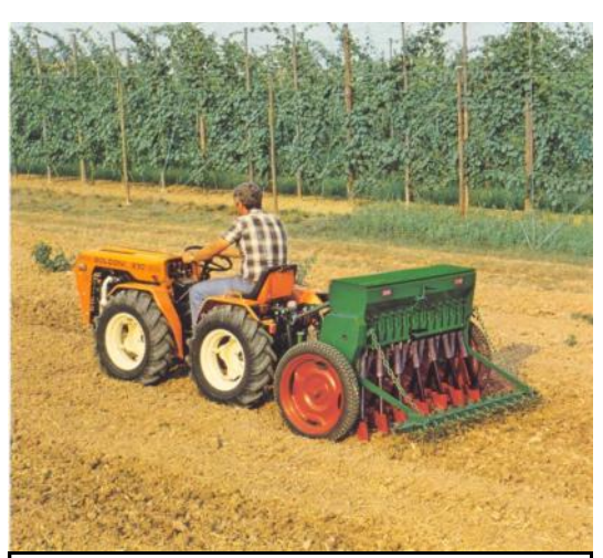
21 HP Tractor drilling hay, grain or cover crop.

The Trattorini's versatility extends to field crops such as hay and grain as well as permacultures such as vineyards, orchards, and woodlots. Appropriately sized implements aid proper establishment and harvesting of these diverse crops.