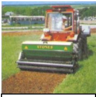
Bury stones and debris with models as narrow as 34" with tractors from 15 HP - 20 HP. Ideal seed bed preparation

For the Market gardener an ideal system consists of growing beds alternating with slightly wider strips of turf. The sod keeps growing area accessible even after rain or irrigation and supports tractor tires avoiding ruts. Tractor straddles growing beds without compacting them. Turf strips slightly wider than tractor tires are easily maintained by tractor mounted mowers. CSAS, you pick farms and farms with on site stands benefit as well from attractiveness of such a growing system.