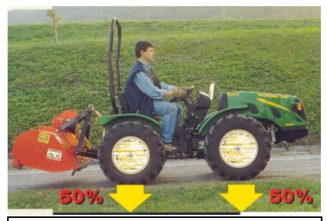
Ferrari Vipar 26 HP with 59" flail mower.

In Italy where small scale enterprises, be they industrial or agricultural, are the rule, they use the term "Trattorini" of the smallest farm tractors. These are <u>not</u> glorified lawn mowers found at U.S. mass marketers but are farm tractors with dimensions and horsepower appropriate to smaller scale and diversified farming operations. They become fully functional because they have standardized 3 pt. systems and PTO's and can be equipped with a large array of implements for land preparation, fertilizing, seeding, transplanting, cultivating, spraying, harvesting, shredding and cover cropping.