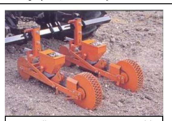
Even smallest tractor can operate precision belt planters each metering unit can put down 1 to 3 lines of seed. Precise spacing minimal doubles mean less thinning and easier tillage.