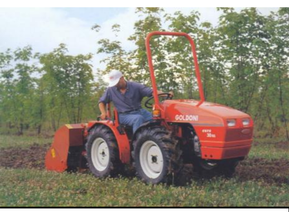
26 HP Goldoni spading in a cover crop. There is no better tillage system, models from just 31" wide.