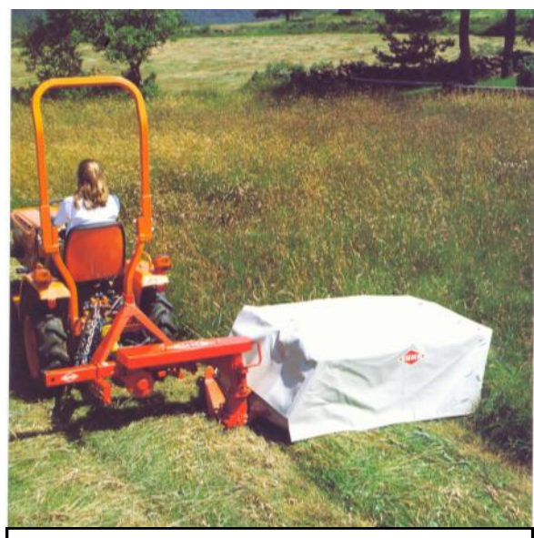
21 HP tractor cutting hay with disc mower.