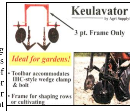
15 Keulavator system 3pt. Arch with

the implement. In either case plantings need to be in as straight a line as possible with multiple lines of plants parallel to one another and parallel to bed if a raised bed is used.