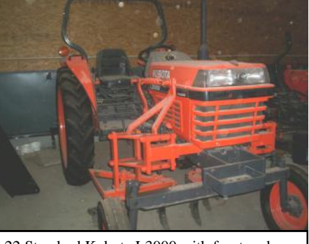
22 Standard Kubota L3000 with front and rear axles lengthened on right so driver can see belly mounted cultivator.

designed to put cultivation implements directly in front and below tractor operator so that he can observe effectiveness and accuracy of tillage being done. Some of these types also allow high clearance to work later crop growth.