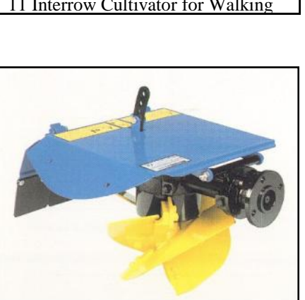
13 Rotary Plow for Walking Tractor

When row lengths become long enough to justify it, four wheel tractors can be equipped with a vast array of cultivator implements to do single or multiple beds. Some rely on tractor driver to steer tractor and the implement and some use a second operator to steer