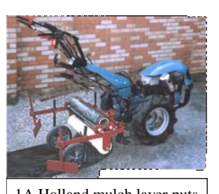
1A Holland mulch layer puts down 24' wide material

Mulches made of paper or plastic can be used to suppress weeds by denying them light. Crop is planted by punching holes to put in transplants at the desired intervals. Some mulch layers automatically punch holes as material is laid down and some systems use a mulch pot transplanter to make the home and set the seedling, set or seed.