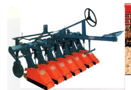
16A Rod weeder: spring steel tines pull out shallow rooted weeds