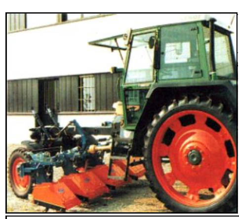
23 Gendt Tool Carrier with interrow cultivator