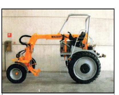
24 Mazzotti Tool Carrier note central 3pt. As well as rear one. Hydraulic motors tools in center and rear.