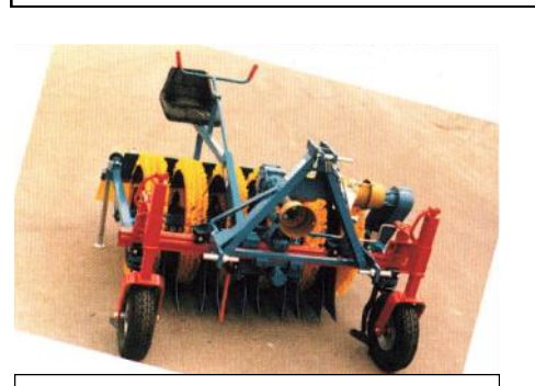
21 Brush Hoe uses stiff bristled brushes to "sweep" out weeds while metal tunnels protect crop.

For high production high precision 20 Steerable Power Harrow heads cultivate cultivations there are specialized tractors also known as tool carriers