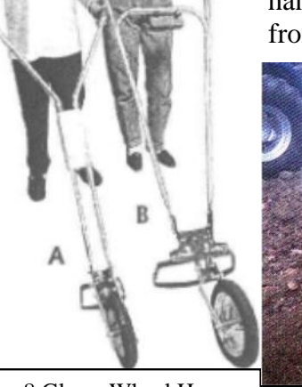
8 Glaser Wheel Hoe

As plantings become bigger wheel hoes in several variations became practical and speed up the work. Because they work in straight line hand hoeing still may be needed to get weeds from between plants along the row.