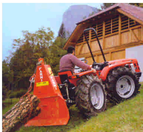
Logging Winch AC Tigrone 63 HP