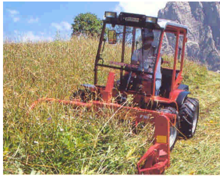
Double Sickle AC HST 38 HP