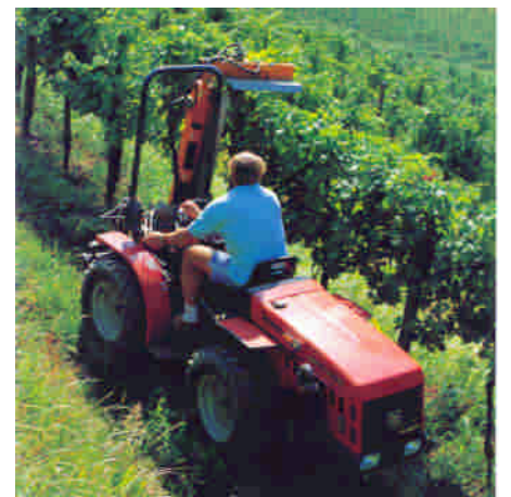
Hedging Tool AC Supertigre 48 HP