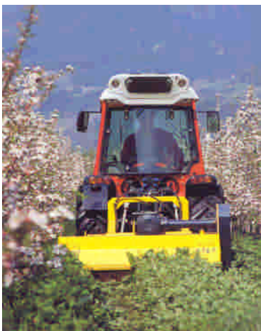
Flail Mower AC TRX 68 HP