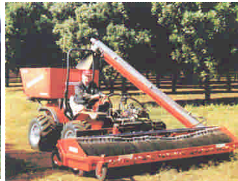
Nut Harvester AC SRX 8400 68 HP