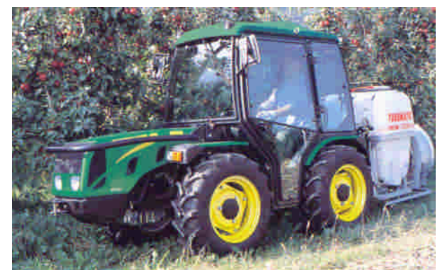
Air Blast Sprayer Ferrari 35 HP