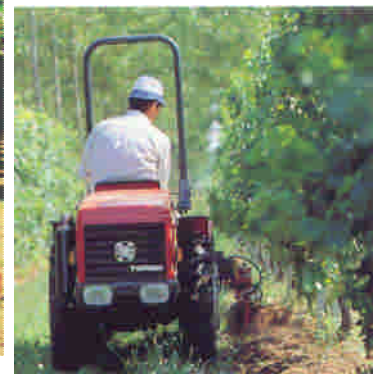
Grape Hoe AC Supertigre 48 HP