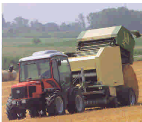
Round Baler AC TTR 83 HP