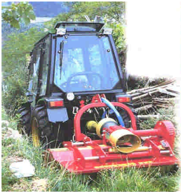
Flail Mower Ferrari 46 HP

Give Ferrari tractor CIE a call at (530) 846-6401 or FAX (530) 846-0390 for details on a model to fit your application. We have supplied this technology since 1990.