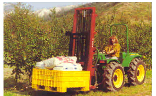
Forklift Ferrari 68 HP