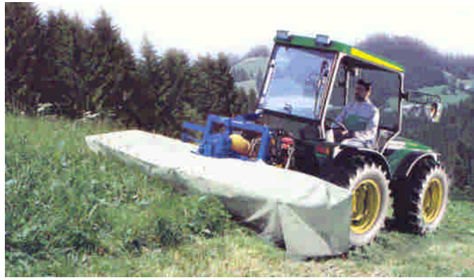
Drum Mower Ferrari 68 HP