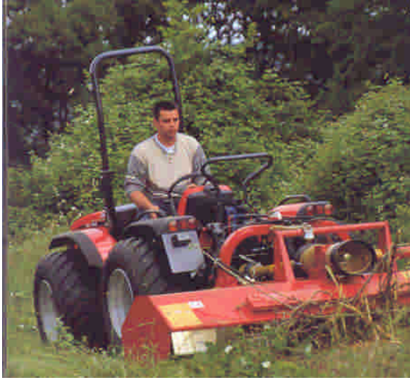
Antonio Carraro TRX-8400 (68HP)