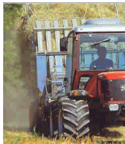
Loose Hay Loader AC TTR 83 HP