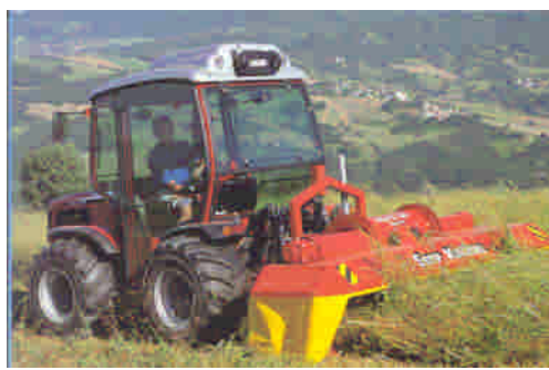
Drum Mower AC TTR 68 HP