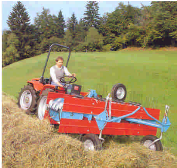
Belt Rake AC Tigrone 48 HP