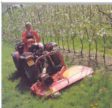
Rotary Mower AC SRX 68 HP