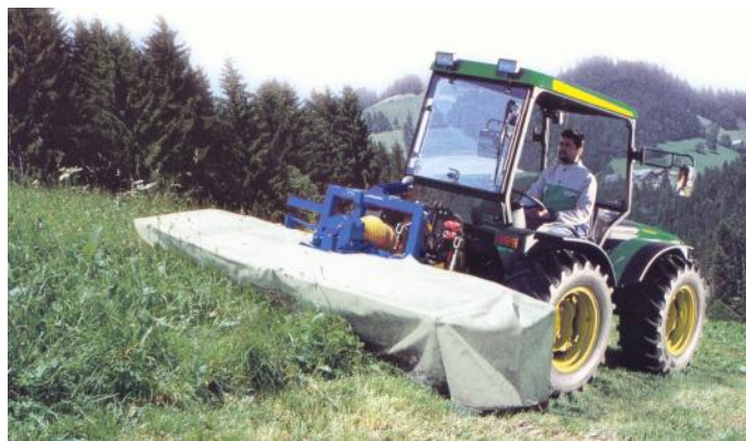
Drum Mower Ferrari 68 HP