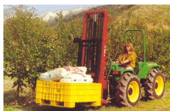
Forklift Ferrari 68 HP