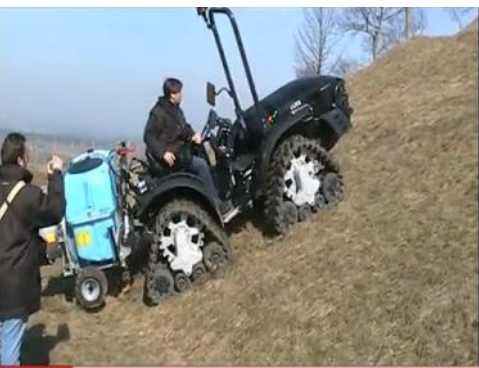
New Antonio Carraro 87 HP Mach 4 Crawler