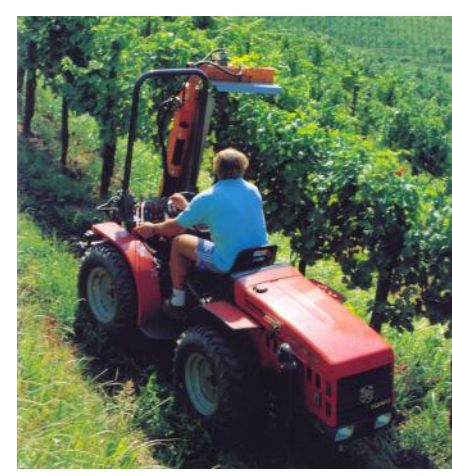
Hedging Tool AC Supertigre 48 HP