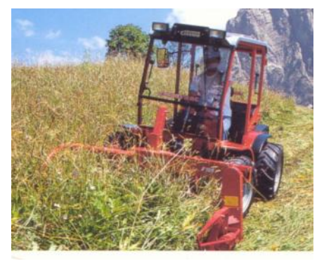
Double Sickle AC HST 38 HP