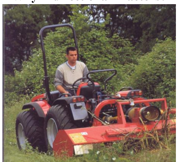
Antonio Carraro TRX-8400 (68HP)