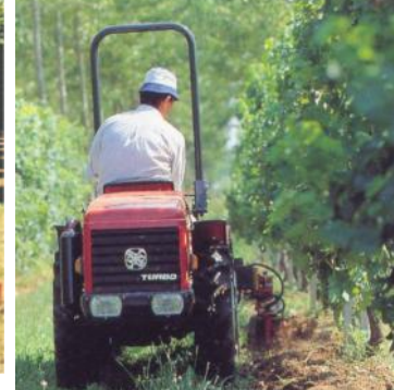
Grape Hoe AC Supertigre 48 HP