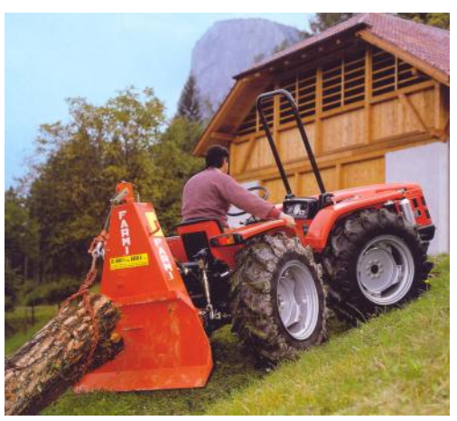
Logging Winch AC Tigrone 63 HP