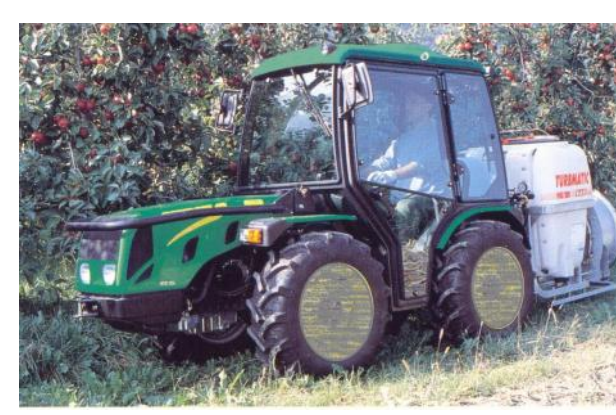
Air Blast Sprayer Ferrari 35 HP