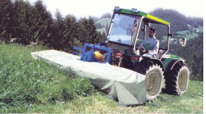
Drum Mower Ferrari 68 HP