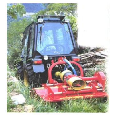
Flail Mower Ferrari 46 HP

Give Ferrari tractor CIE a call at (530) 846-6401 or FAX (530) 846-0390 for details on a model to fit your application. We have supplied this technology since 1990.