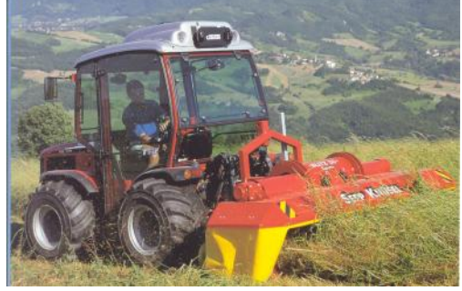
Drum Mower AC TTR 68 HP