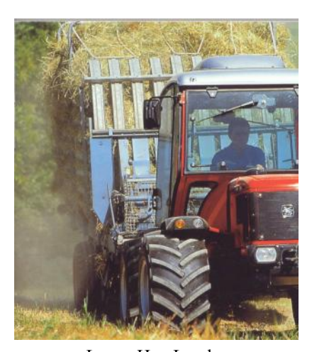
Loose Hay Loader AC TTR 83 HP