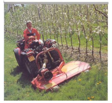
Rotary Mower AC SRX 68 HP