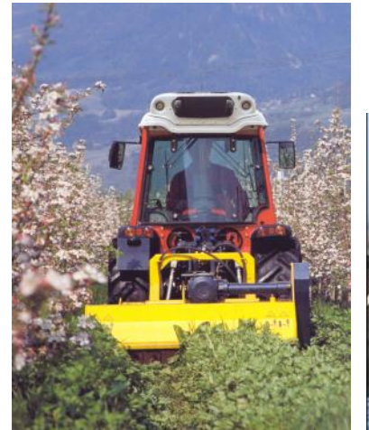
Flail Mower AC TRX 68 HP