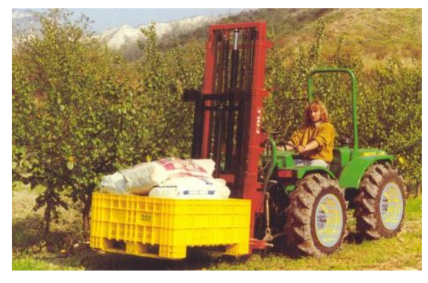
Forklift Ferrari 68 HP