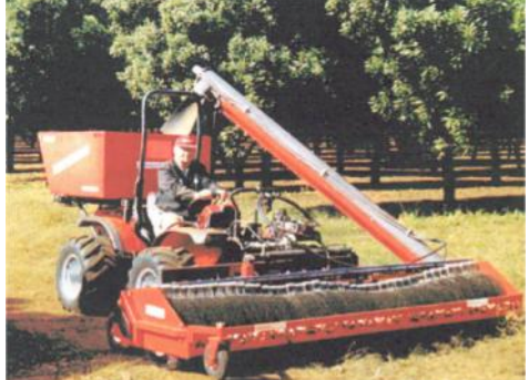
Nut Harvester AC SRX 8400 68 HP